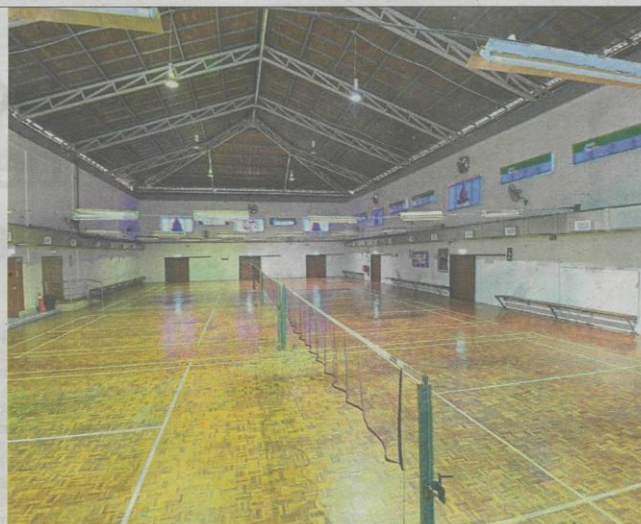
Syed Mohd says residents are baffled why the air-conditioners have been installed when the wiring system cannot support their use.