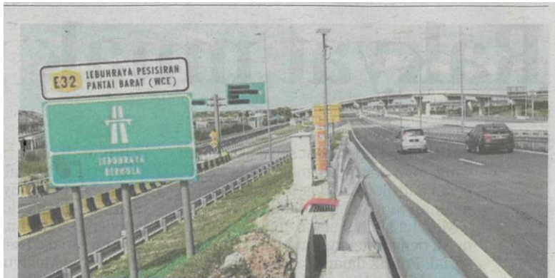
Lebuhraya Pesisiran Pantai Barat babit keseluruhan jajaran 233 kilometer. (Foto hiasan)