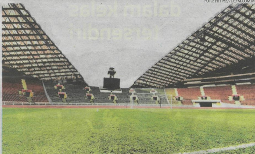
Stadium Shah Alam gelanggang keramat The Red Giants .

“Kerajaan negeri dan DEFM Sdn Bhd akan berusaha keras bagi memastikan mercu tanda sukan di Selangor ini men-