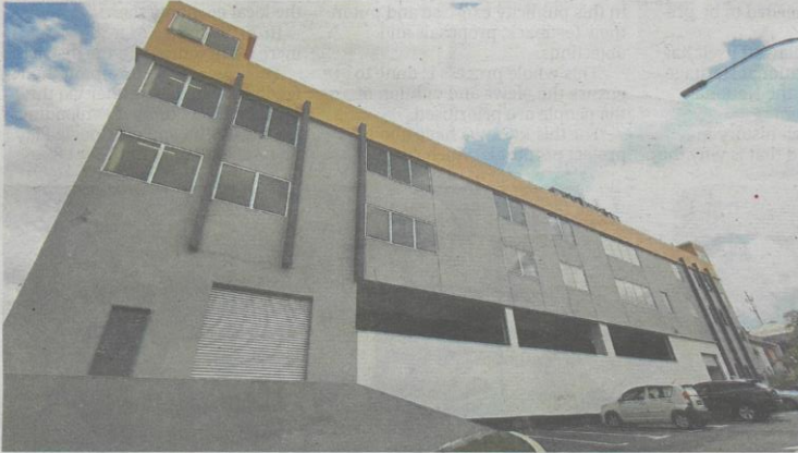
Roadside market traders at two spots are supposed to move into Pasar Mahkota Sentral by March 1.