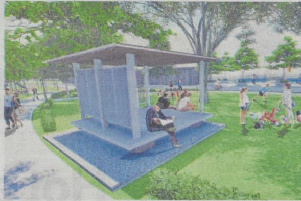
(Above and below) The Bandar Malawati Special Area Draft Plans 2025 focuses on preserving historical landmarks and heritage sites in addition to boosting tourism in Kuala Selangor.

"There is so much history in Bukit Malawati and that is why the